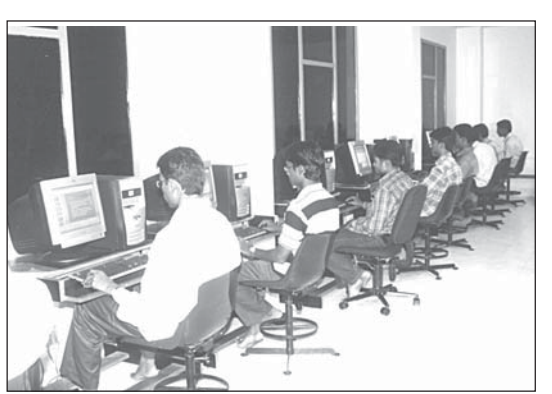
MBA students on Computers

The Faculty makes a special effort, apart from its academic responsibility, for the personality development of students. A number of student events are conducted on a regular basis, for improving the communication skills, leadership qualities and overall development of students. The Faculty is committed to train the students for participation in various "Student Meets" organised by different centres of management education in the State and the effort produced great results.