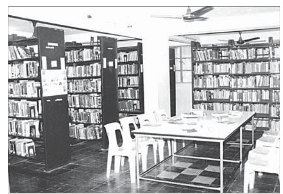
Our Journal Section in the Library