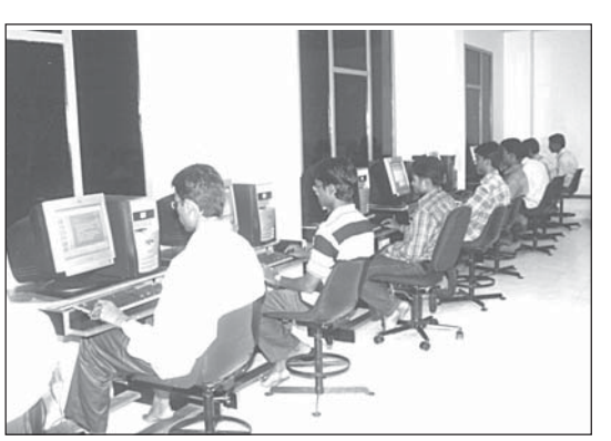
MBA students on Computers

The faculty is committed to train the students for participation in various "Students Meets" organized by different Business Schools in the state, our students won many laurels in various events such as Market Makers, Young Manager, Business Quiz, Stock Marlet Event, HR Event etc. by bagging the first and second place. The efforts put in by the faculty produced great results.